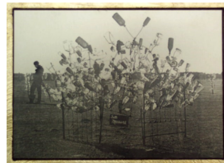
Bottle Farm - Winter Zellar (Zero) Swartzel, Grandfather of Pop Art